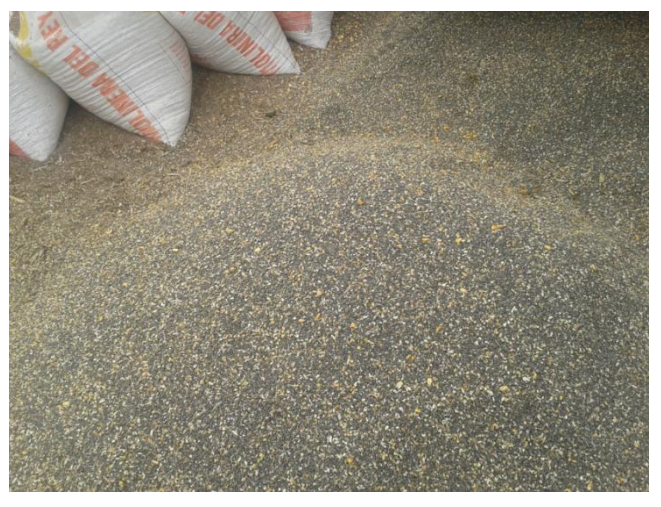
Photo 1. A pile of jimsonweed seed obtained from a highly contaminated corn grain shipment.

stramonium ), contaminating corn crops. If pesticides are not applied, contamination can lead to potential poisoning of livestock. The following photo shows a pile of jimsonweed seed obtained from a highly contaminated corn grain shipment