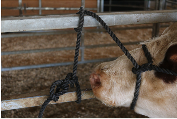
Proto 4: Appropriate Tying of a Calf Already Trained to Tie