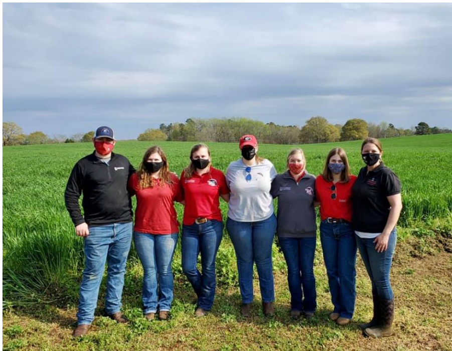
Dairy Science Club members that worked to make the 2021 State Dairy Judging Contest a success for youth in the state.

Contest results are announced here https://www.youtube.com/watch?v=94cqO_Tv0_4