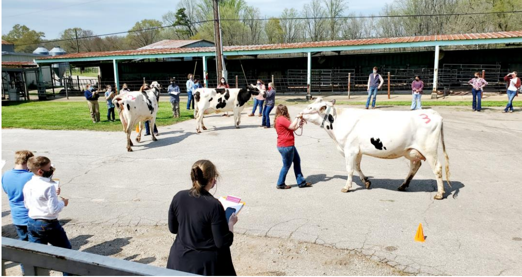
Youth members view a haltered Holstein class for the 2021 State Dairy Judging Contest.