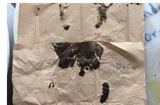
Figure 2. Towel test showing poor coverage of spray dip (top), compared to dip cup (bottom)

If there are any doubts as to whether teat dips, in any form, are being applied correctly the easiest way to check is by doing the “towel test”. Take a white towel or paper towel and wrap it around the teat after dip application, making sure to include the teat end. You should be able to observe complete coverage of the dip (Figure 2). If not, it will be quite clear that technique needs to be improved or method of application needs to be changed.