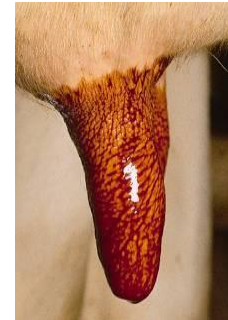
Figure 1. Teat that has been fully dipped with an iodine-based teat dip

All forms of application (dip, spray, and foam) CAN be effective if applied correctly, meaning the entire teat including the teat end is covered in dip (Figure 1). Dip cups are the most common form of application and can be highly effective if the cup is a non-return cup that is appropriately sized/shaped, kept clean through milking, functions properly, and applied correctly. For example, a Thrifty Dipper is an excellent option to reduce dip waste, but if bristles become bent or heavily contaminated, application and efficacy is decreased tremendously.